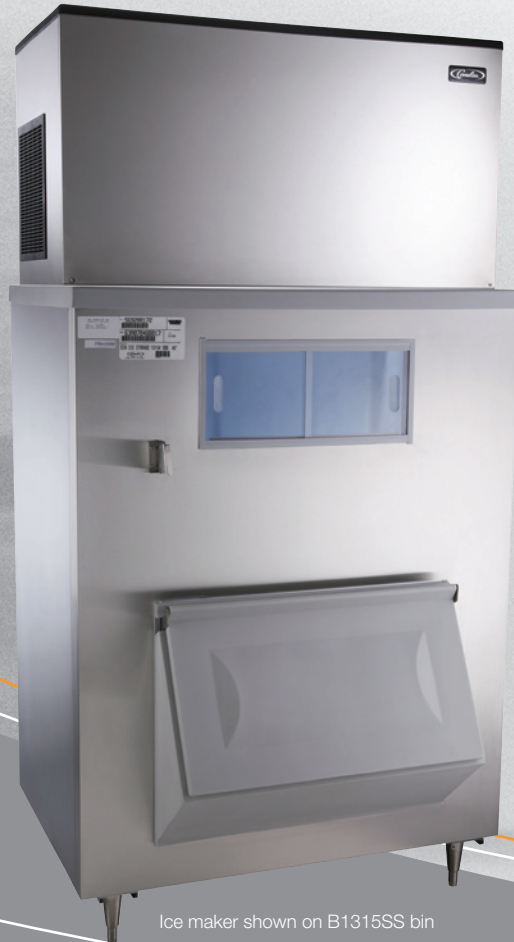
Ice maker shown on B1315SS bin